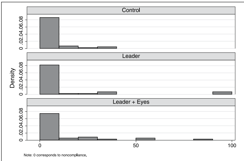
Figure 5. Percent of income earned donated in charity task.

* p < .10, without multiple comparison. ** p < .10, with Benjamini–Hochberg multiple comparison adjustment.