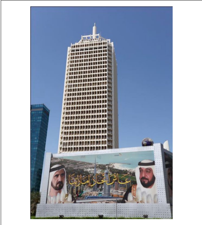
Figure 2. The Dubai World Trade Center, United Arab Emirates.

Photo taken May 27, 2011.