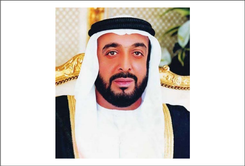
Figure 3. Example of Sheikh Khalifa treatment image.

monitoring effect. Scholars have shown that images that signal being observed, such as stylized eyes, can affect behavior (Haley & Fessler, 2005; Panagopoulos, 2014). To address this concern, we also include a second experimental condition (the Leader and Eyes Treatment), in which subjects are exposed to an image of stylized eyes in addition to Sheikh Khalifa. 11 As in the main experimental condition, the treatment occurs when subjects are twice exposed subliminally to Sheikh Khalifa’s image and twice exposed to the stylized eyes. The order of exposure to the images is randomized. If the additional exposure to the eyes has no effect on compliance and support relative to the effect of the image of Sheikh Khalifa on its own, this would suggest that no general monitoring effect is in operation. If it does have an effect, this would suggest a monitoring effect. 12